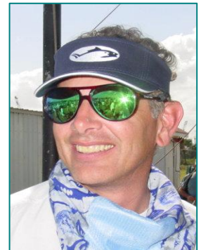
EPA or DEA or CIA